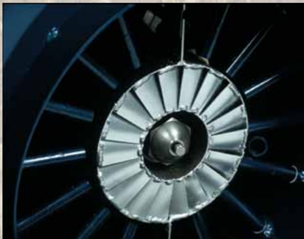
Unique firing head produces stable combustion over wide turndown.