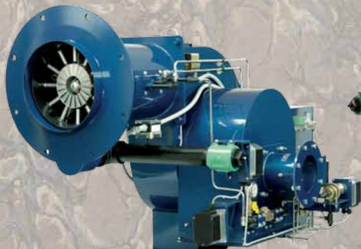
Low Excess Air CMAX